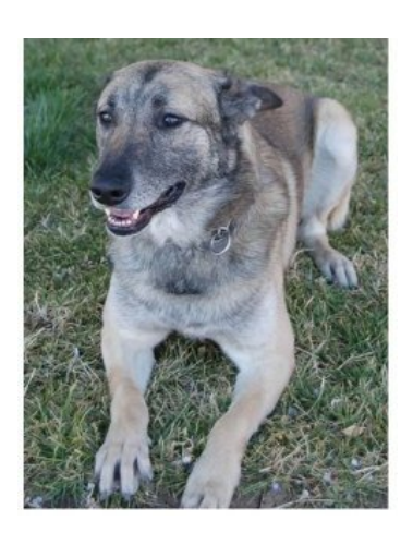
Police Service Dog Ringo

The K-9 Unit takes an active part in assisting Patrol and the Narcotics Unit on a daily basis. For 2011, they took part in the following: