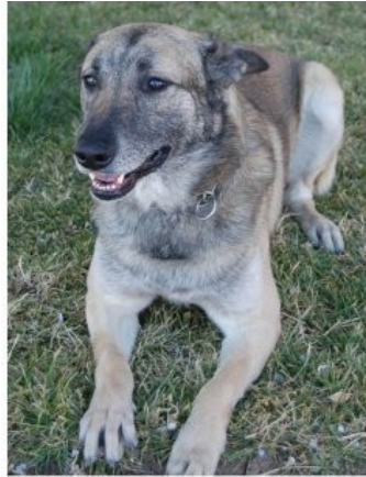
Police Service Dog Ringo